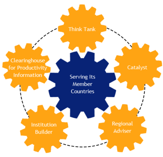
Five kev roles of the APO