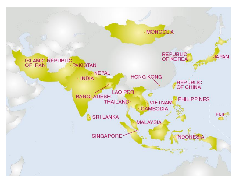
APO member economies

The current membership comprises 20 economies, rich in ethnic, cultural, social, and religious diversity and with unique strengths and needs for productivity enhancement and socioeconomic development. At the same time, these economies pledge to assist each other in their productivity drives in a spirit of mutual cooperation by sharing knowledge, information, and experience.